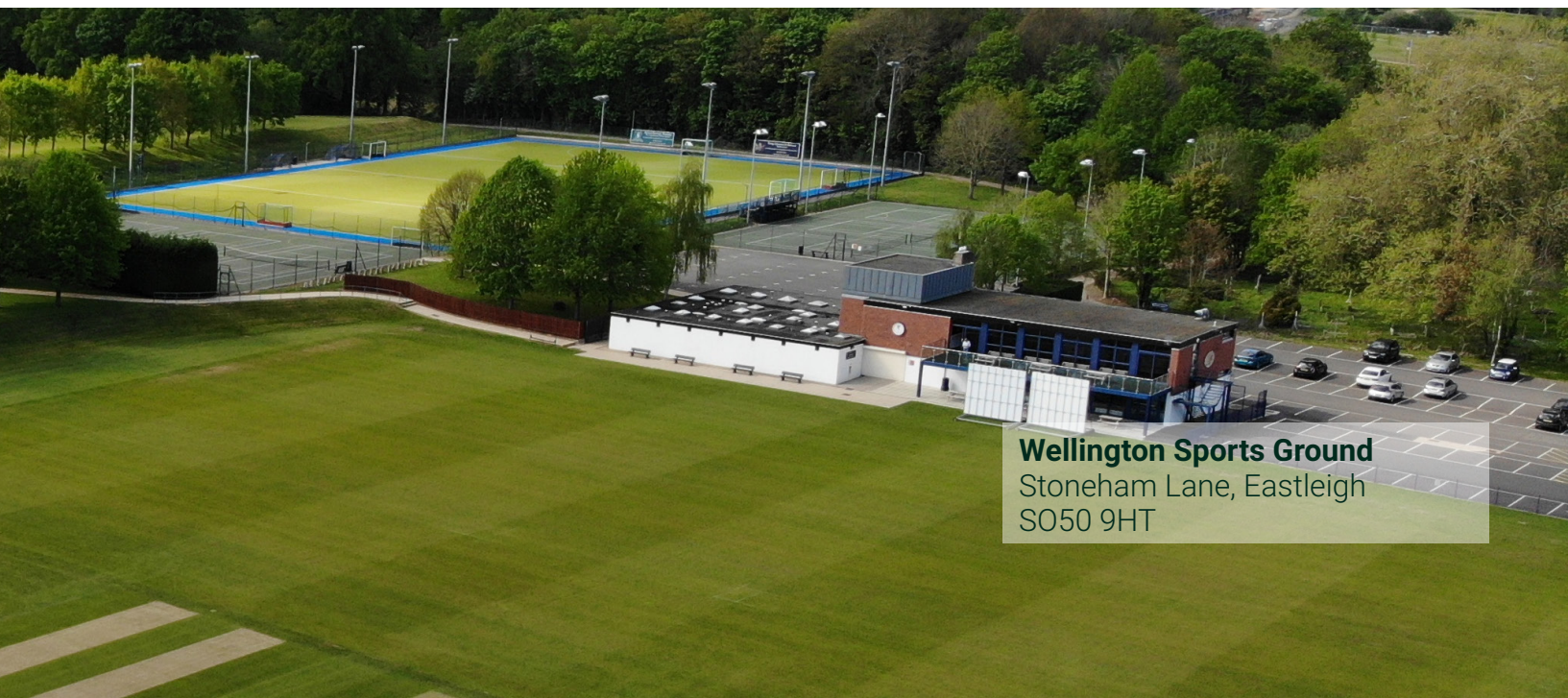
Wellington Sports Ground Stoneham Lane, Eastleigh SO50 9HT

There will be medical cover provided on site. Please can all schools bring a first aid kit and be prepared to deal with any minor issues.